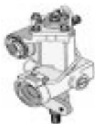
Front Suspension and Steering, looking from the back to the front: