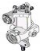
Front Suspension and Steering, looking from the back to the front: