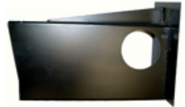
left side tank LR54A