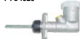
550732G or 550732P