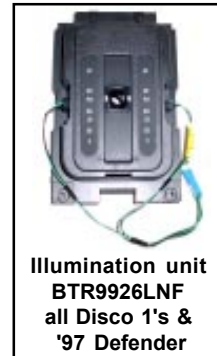
Illumination unit BTR9926LNF all Disco 1's & '97 Defender